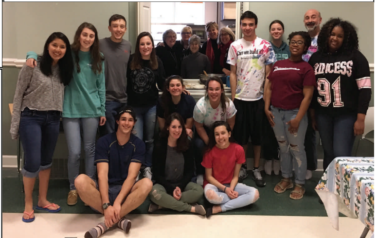
Selwyn hosted 14 volunteers from East Connecticut University for a week in March. The group worked during their mid-winter break on Habitat houses in Charlotte while staying in the Bowman building. Pictured is the group after a chili dinner hosted by the Mission Group.